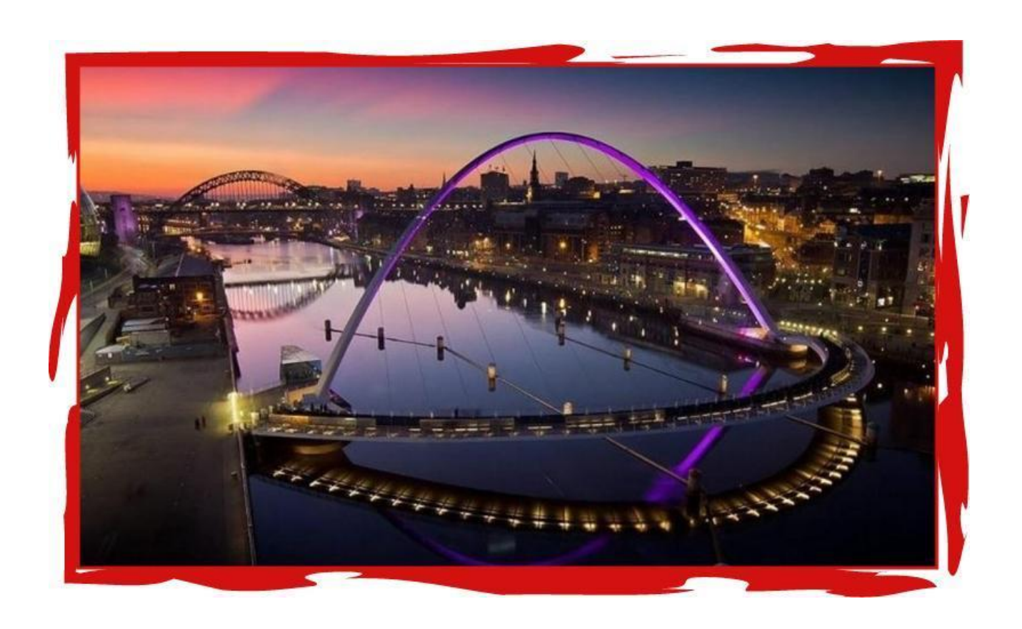
Tyne River and two of its 7 bridges in Newcastle: Millennium Bridge and Tyne Bridge