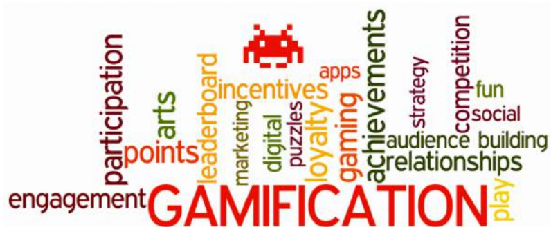
Masca:SEASIDE GAMES GAMIFICATION: What for?