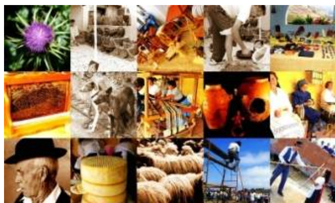
CANARIAN CULTURAL PRESENTATION ENVIRONMENT WORK: Alien de-plant with local youngsters